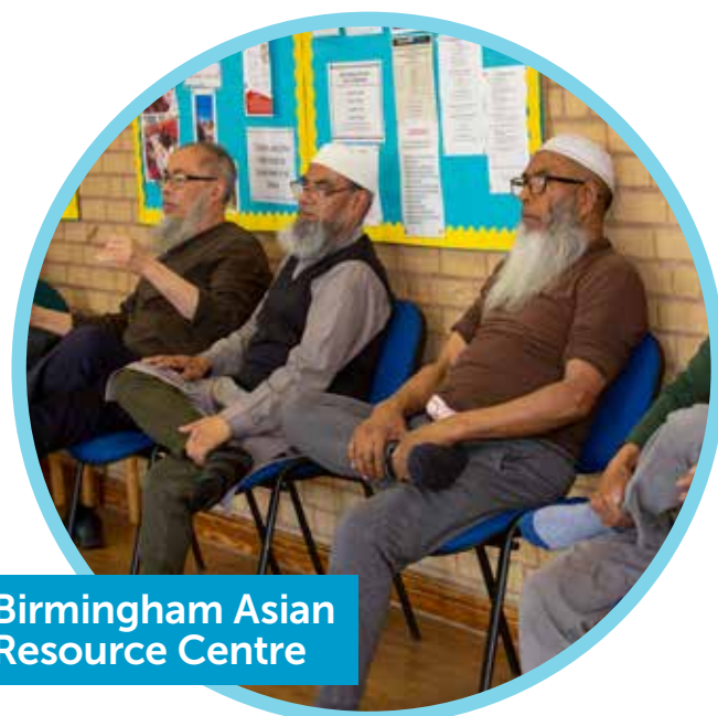
Birmingham Asian Resource Centre